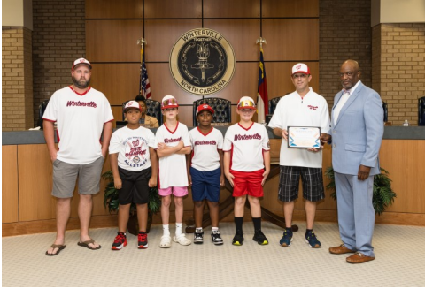
2024 Winterville 8-Year-Old Cal Ripken All Stars