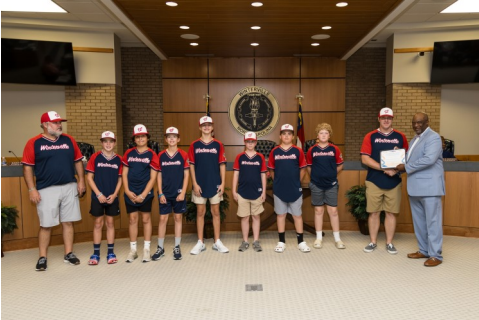
2024 Winterville 11-Year-Old Cal Ripken All Stars