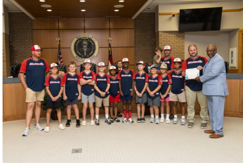
2024 Winterville 9-Year-Old Cal Ripken All Stars